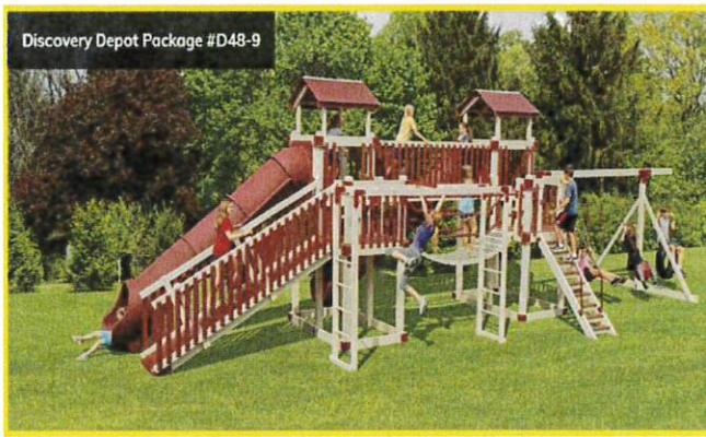
Proposed new playground

Dept of Illinois VFW & Auxiliary proposed project Help the National Home replace the playground between the Community Center and the Health & Education buildings.